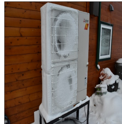
Figure 5: Overly iced-up Mitsubishi outdoor unit (42,000 BTU/hr).