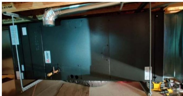
Figure 2: Mitsubishi Zuba (36,000 BTU/hr) indoor unit installed horizontally in a crawlspace.

Prior to installing an air-source heat pump, get an NRCAN-Certified Energy Advisor to complete an energy assessment of your home to identify the heating and cooling loads. Accurately identifying a home's heating demand is essential to correctly identifying the best corresponding heat pump size. Oversized heat pumps will have significantly reduced efficiency.