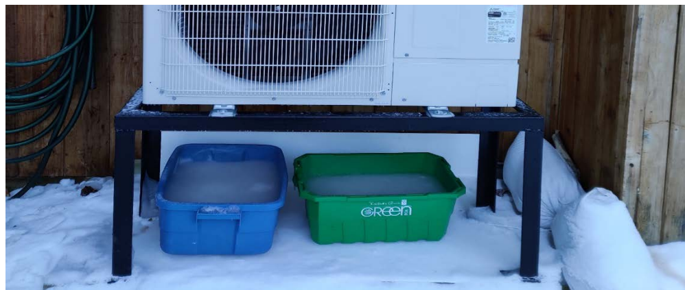
Figure 3: Mitigation measures taken to manage the defrost water coming off the Mitsubishi Zuba (42,000 BTU/hr) outdoor unit included putting bins and sandbags under and around the unit.

Several homeowners reported that the winter maintenance tasks were substantial and for some, required daily attention.