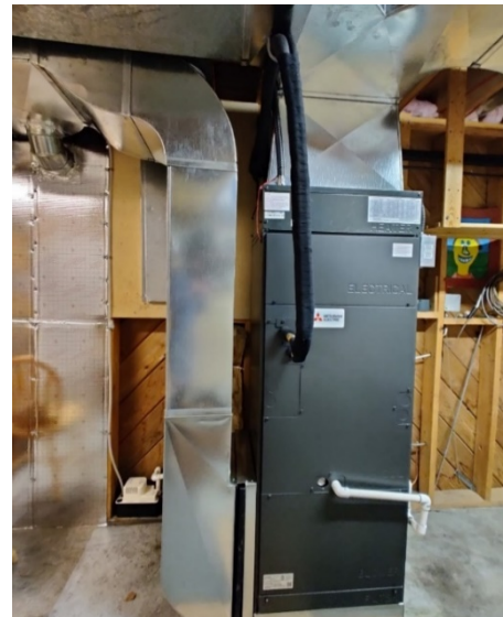
Figure 1: Mitsubishi Zuba (42,000 BTU/hr) indoor unit with single side return installed

Here are the lessons learned from the five participants and from the air-source heat pumps' operations during the winter 2020-2021 heating season.