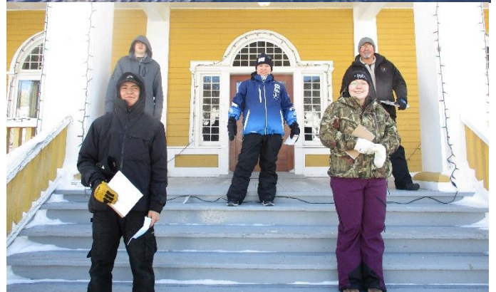
Congratulations to the graduating classe