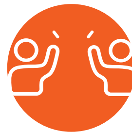
a 2-metre cheer