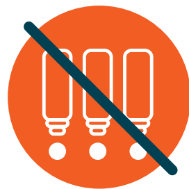
a bingo dabber