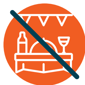
a dinner party