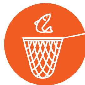
fishing tips and spots