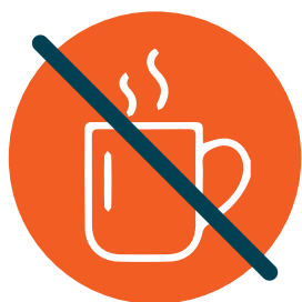
a coffee cup