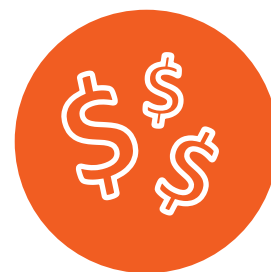
the winning prize