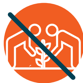
a gardening party