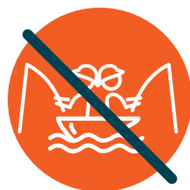
a fishing trip