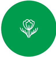
Thriving Tourism Economy