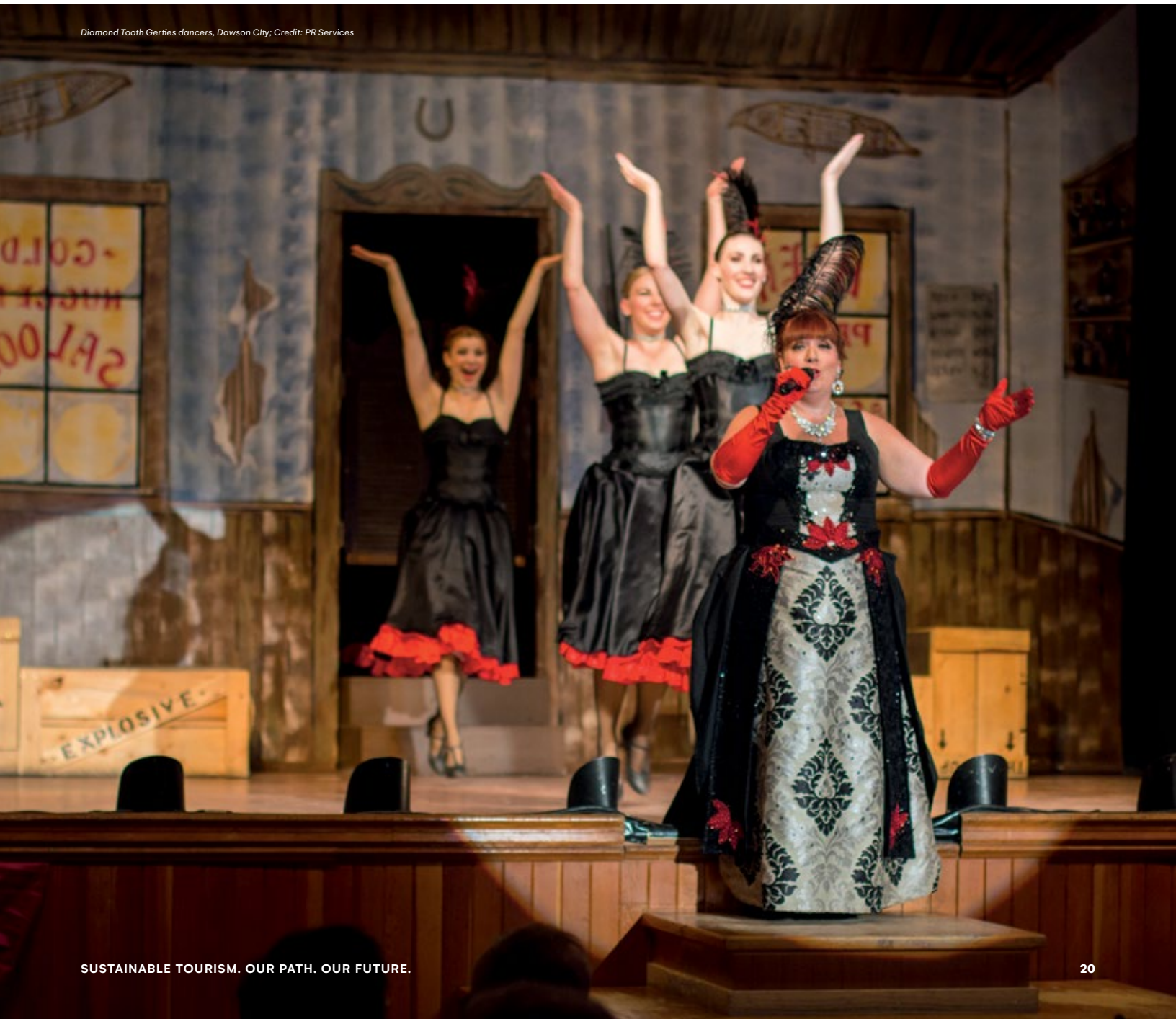
Diamond Tooth Gerties dancers, Dawson City.

Promote the Yukon as a destination for meetings and conferences, focusing on the shoulder and winter seasons, and communities where capacity exists or can be developed.