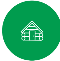
Resident Support for Tourism