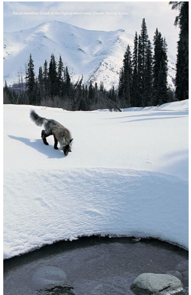
Fox at Hamilton Creek in the Ogilvie Mountains