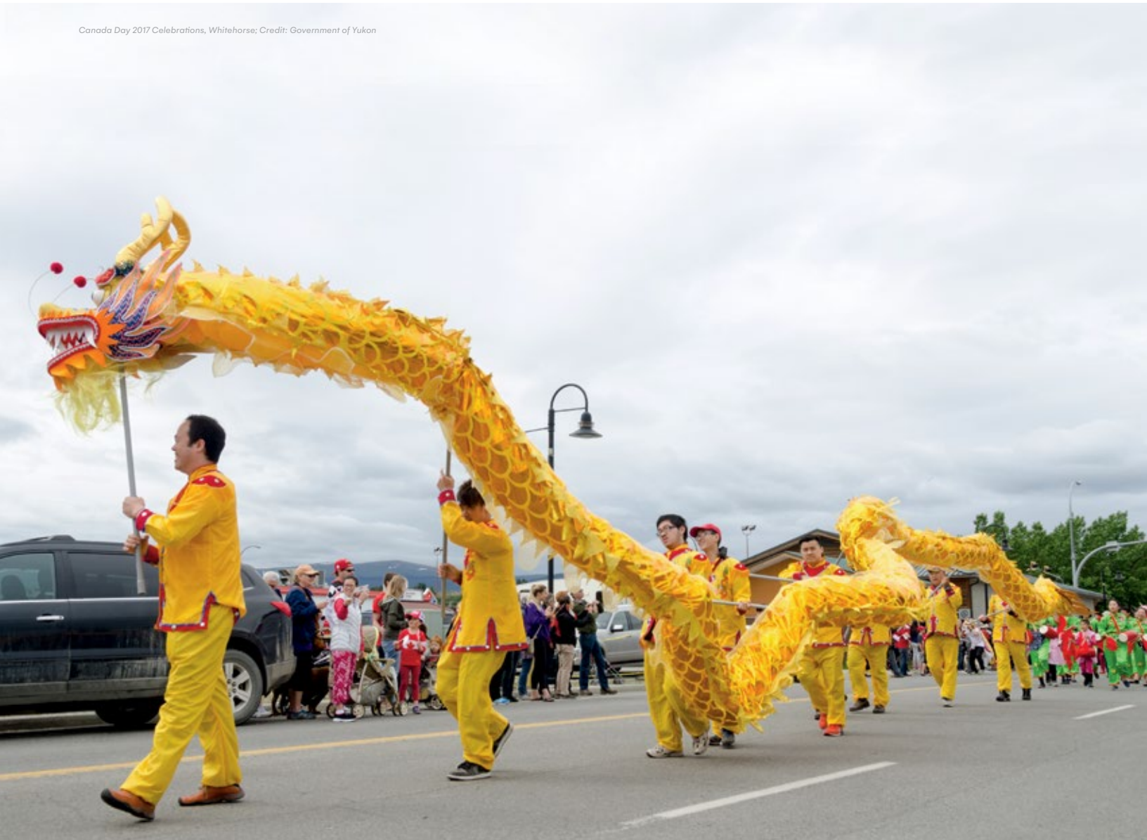
Canada Day 2017 Celebrations, Whitehorse

Yukoners appreciate that our communities are truly unique and believe they should be celebrated. Tourism can play an important role in developing our communities through job creation, strengthening community services and supporting infrastructure that benefits everyone. We want to ensure this is done in a way that allows our communities to retain their authentic identity and character while benefiting from tourism development.