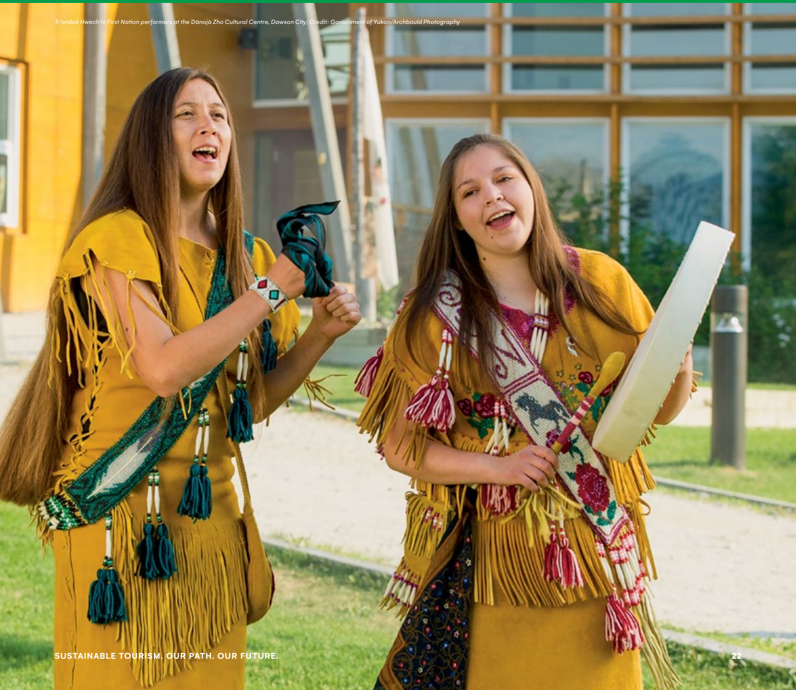
Tr'ondek Hwech'in First Nation performers at the Dänojà Zho Cultural Centre, Dawson City.

The Yukon is home to fourteen First Nations, each with their own rich history, culture and traditions. Supporting the development of Indigenous tourism can provide opportunities for Yukon First Nations to share and celebrate their stories in a meaningful and authentic way.