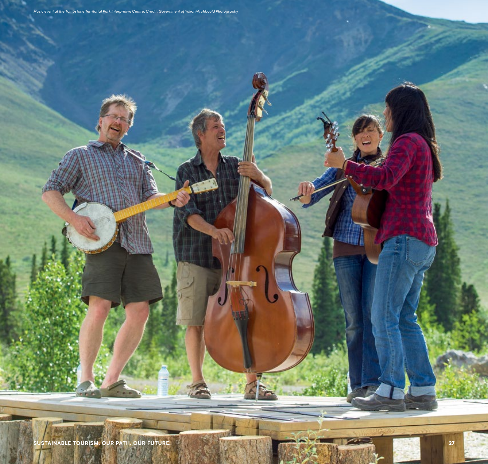
Music event at the Tombstone Territorial Park Interpretive Centre

Develop and leverage opportunities to encourage resident travel within the territory.