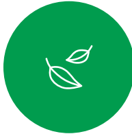
Sustainable Tourism Development