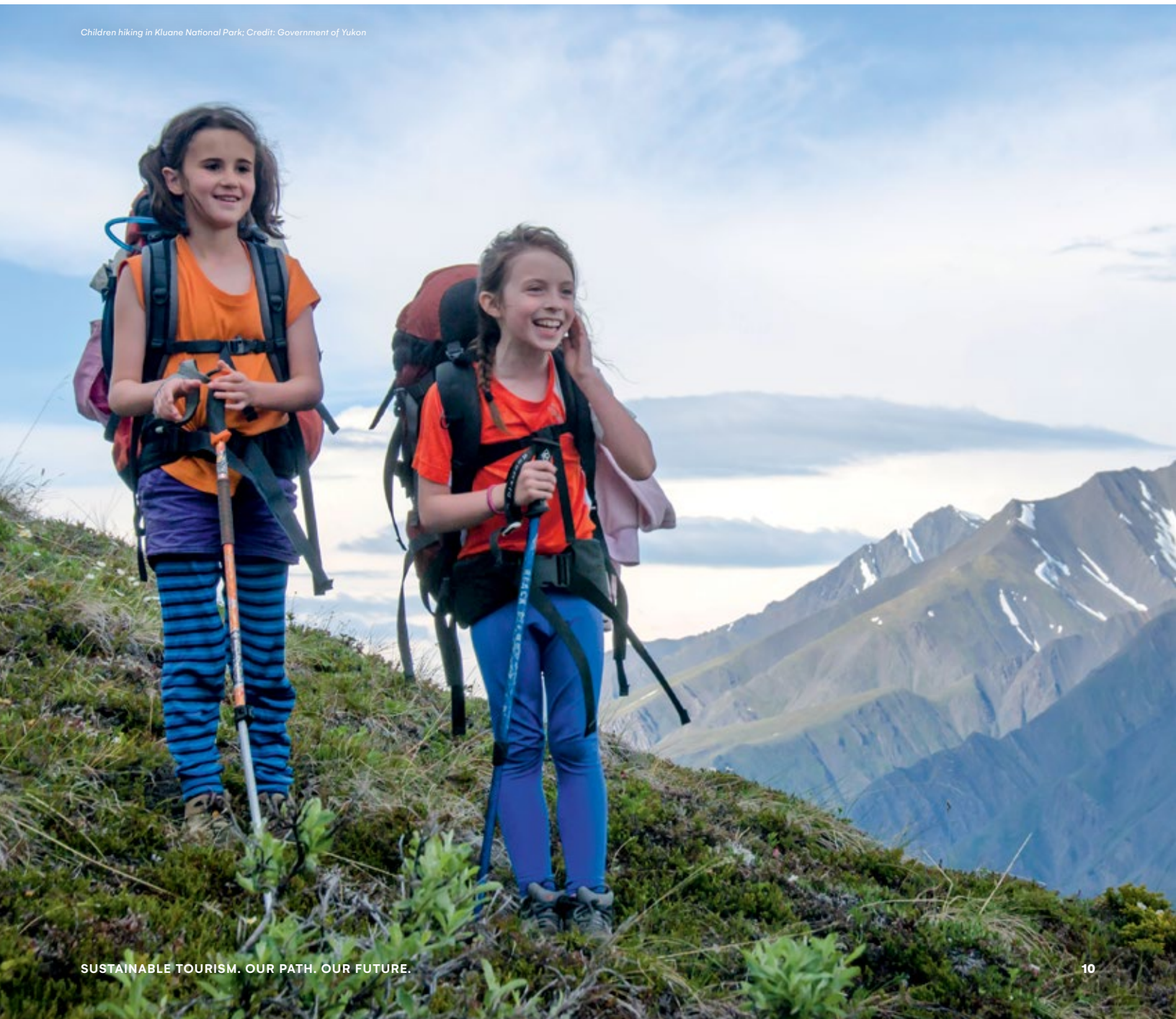
Children hiking in Kluane National Park.

Yukoners love being in the outdoors and value vast expanses of pristine wilderness and abundant wildlife. Our natural environment must be effectively managed so that visitors and residents can explore our wild and dynamic landscapes without detracting from them or impacting wildlife habitat. Our wilderness is our strength and a fundamental part of who we are.