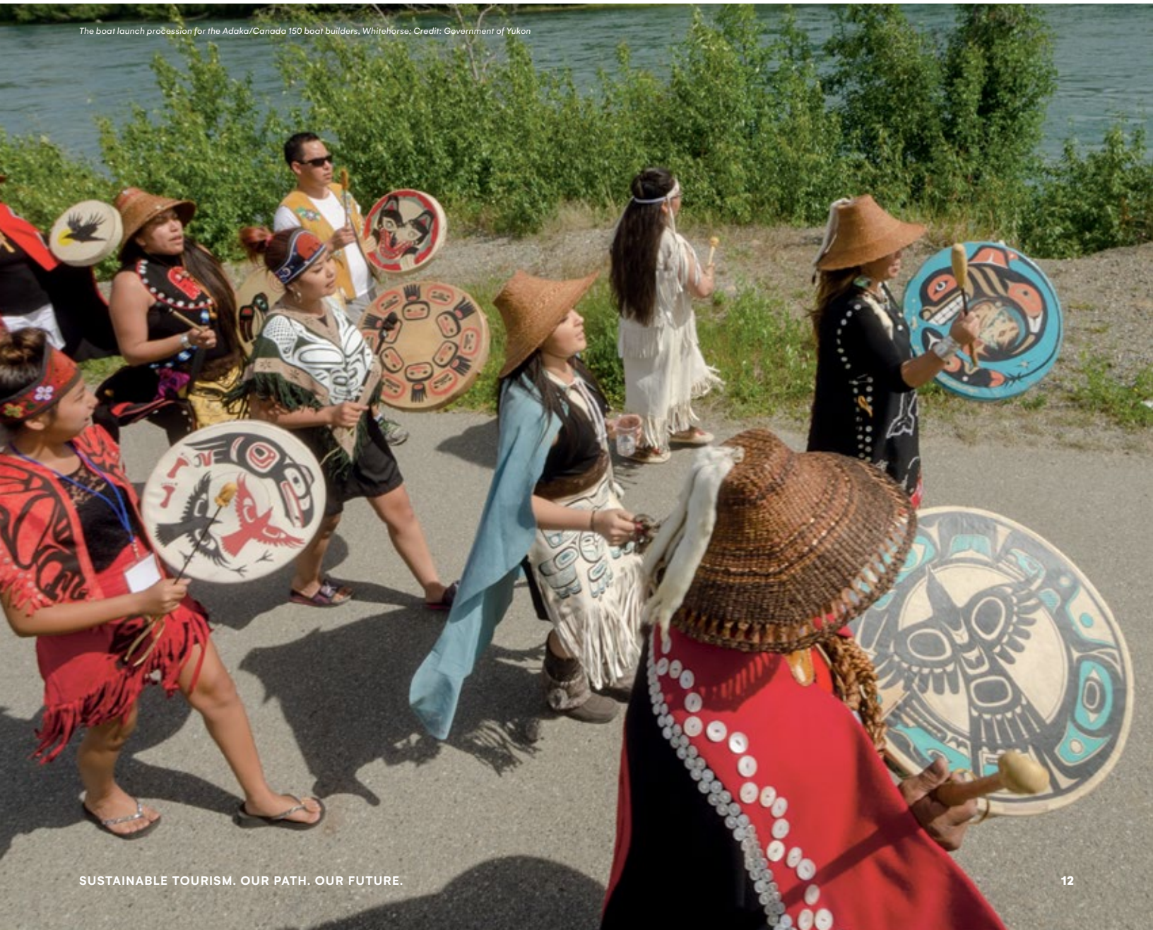
The boat launch procession for the Adaka/Canada 150 boat builders, Whitehorse; Credit: Government of Yukon

Yukoners value creative solutions and action. There is excitement in the industry and across the territory about the diverse opportunities tourism can provide, and Yukoners want to see a bold vision for the future supported by the innovative and creative solutions that can help get us there.